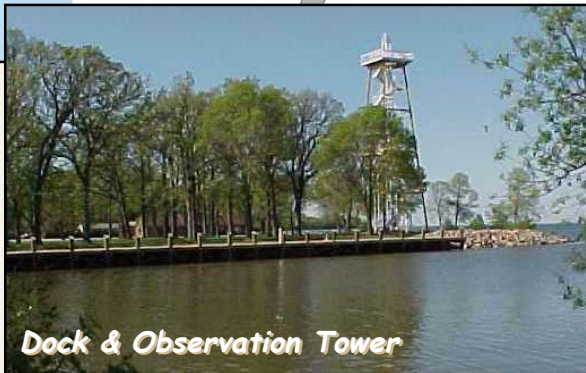
Dock & Observation Tower